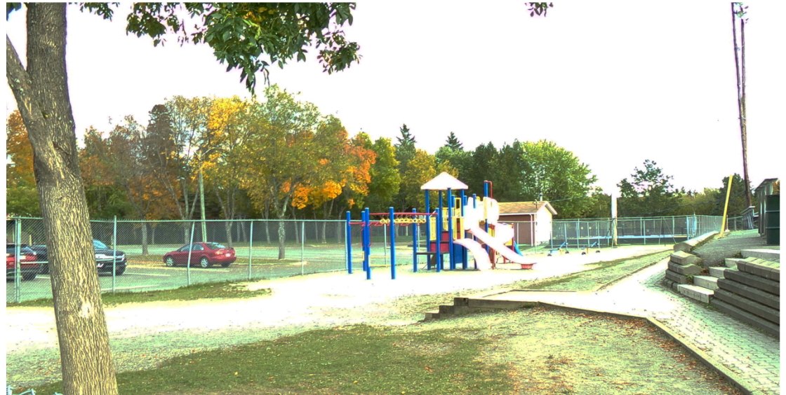
Current playground has seen its better days.

The John Caldwell playground has seen its better days. Back in the 2013-14 school year the only playground at the school had failed to pass safety inspection. Due to the safety issue most of the equipment had to be taken down.